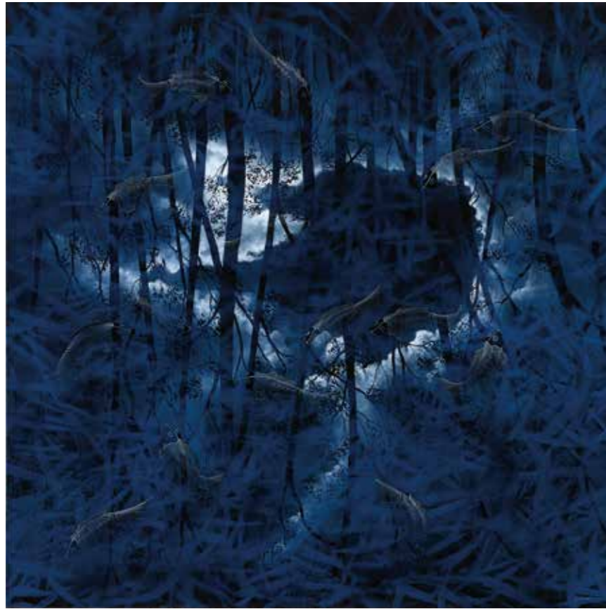
Figure 2 Moonlight at Numerili 2 1993 synthetic polymer paint on canvas 182.0 x 182.0 cm Sold Menzies, Sydney, 31 March 2021, lot 25, $515,455 (including buyer's premium)