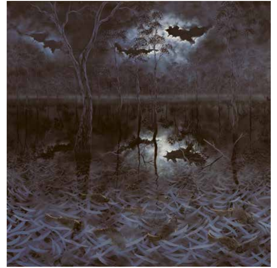
Figure 3 Morumbeeja Pitoa (Floods and Moonlight) 1993 synthetic polymer paint on canvas 182.5 x 182.5 cm Queensland Art Gallery | Gallery of Modern Art collection, Brisbane Queensland Art Gallery Foundation, purchased 1995

His deep connections to Arnhem Land and kinship with Wunuwun, however, enriched his physical self and spiritual world view, and animated his mixed race/mixed cultural 'in-between space.' 12 It also heavily influenced his vision and optimism for his legacy, with hopes that history 'may see me as some sort of bridge between cultures ...' 13