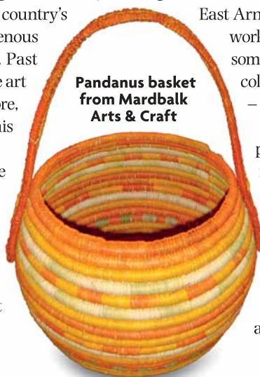
Pandanus basket from Mardbalk Arts & Craft