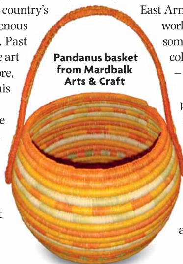
Pandanus basket from Mardbalk Arts & Craft